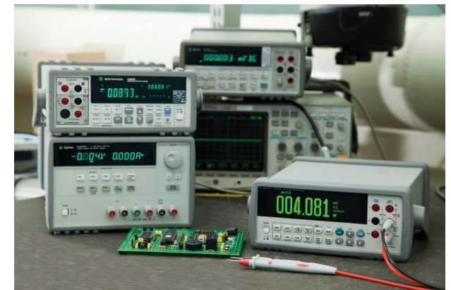
Bright OLED dual display makes reading measurement an effortless task